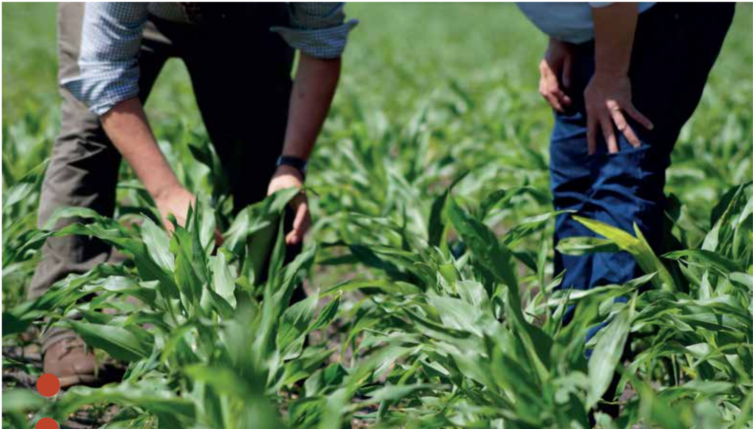
We use the resources we need as efficiently as possible.

The gradual expansion of environmental management systems is an essential basis for this. At the same time, it is the primary instrument for managing and continuously improving our environmental performance.